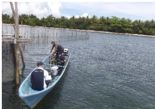
Figure 6 – Environmental Data Collection

The environment is related to socioeconomic characteristics. Damage to the ecosystem may reduce ecosystem goods and services. There is various research using environmental characteristics to determine existing biota. However, the socioeconomic characteristic is equally crucial for stakeholders' decision-making. Plotosus was sold in the Jembatan Puri fish market at certain times. The waters of Sorong and its surrounding is the placed to catching the fish like catfish. Papuan Catfish has economic value as one of the animal-based food sources for the community. Papuan Catfish is available in Jefman Island, Raja Ampat, and Sorong. The anthropogenic pressure in Sorong waters influences the sustainability of Papuan Catfish.