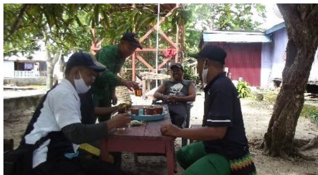
Figure 4 – Observation and Interview with fishers of Jefman Island