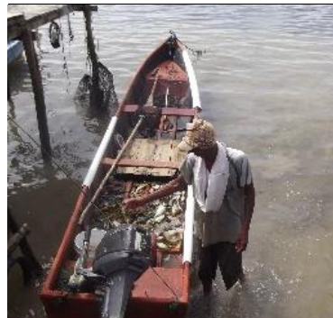
Figure 3 – Fishers of Jefman Island