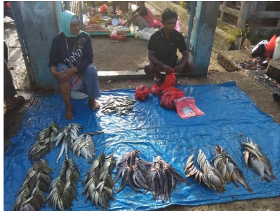
Figure 5 – Jefman Island fish and catfish trader at the Jembatan Puri, Sorong City

The fishermen gather and sell their catch in Jembatan Puri, the Sorong City fish market. Fish from Jefman Island are traded at the Jembatan Puri fish market by fish traders/fishers from Jefman Island. However, the availability of catfish depends on the season, such as the rainy season. Papuan Catfish is sold in a bundle. Fishers bundle the catfish using a bamboo rope. The fishers and traders sell a bundle of twenty Papuan Catfish for IDR 20,000.00 to 30,000.00. They sell the catch during the weekend due to many visitors. The fish trading activity is illustrated in Figure 5.