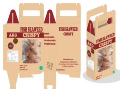
Figure 3. Packaging design planning.

Especially in the process of making food box or paper bag. In addition to the thickness, this paper also turns out to be one type of food grade paper (not harmful to food consumed). Standard paper for printing with offset machines and digital print with semi-shiny and smooth front and rear surfaces. This Art paper is perfect for all types of full color/color separation. To add an elegant impression to the mold can be added with doff laminating, laminating glossy and UV print (Ultra Varnish). Based on its function, packaging has a variety of functions, namely protection function or product protection, security function which means that the material used does not pollute the contents of the product, the marketing function is that the packaging is able to answer the aspirations of consumers [22]. Based on the design of the label and packaging design above it is expected that it might be used as a reference by CV ocean fresh in designing packaging for crispy fish seaweed products.