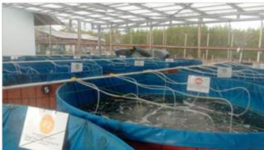
Figure 1. Rearing pond of L. vannamei in this study.

FCR was calculated at the end of the rearing period based on Sarjito et al. [27] as follows: