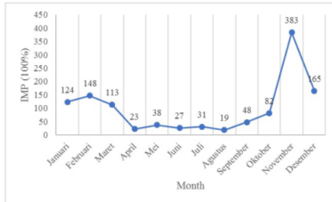
Fig. 2. Lobster Seasonal Fishing Index Pattern in Cilacap Waters, Central Java

point is not the fish season (low season). The graph of the fishing season index to determine the season pattern can be seen in Figure 2.