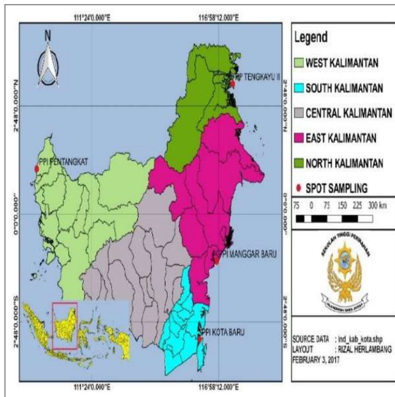
Fig 1: Map of research area

The territory of the island of Borneo within the territory of the Republic of Indonesia, located between 4° 24' NL - 4° 10' SL and between 108° 30' EL - 119° 00' LW is about 535,834 km 2 . It is directly adjacent to Malaysia (Sabah and Sarawak) in the north, whose border length is about 3,000 km from West Kalimantan to East Kalimantan.