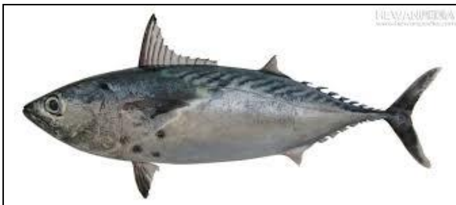
Figure 3. Auxis thazard (FishBase).

According to Ghosh et al (2012), the size of the fish first reached gonad maturity at a fork length of 29.7 cm. According to Tampubolon et al (2016), A. thazard in the waters of western Sumatra have a standard length of 34.89 cm. Based on the research of Ghosh et al (2012), the frequency of mature tuna landed at the Kusamba fish auction is only 12% of the total sample. This can be caused by the size of the mesh used by the fishermen, which is too small, causing immature fish to be unable to escape from the net.