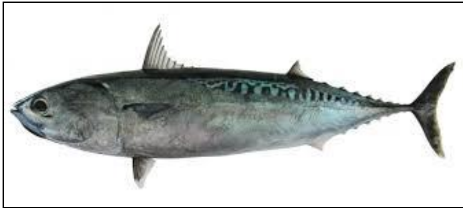
Figure 2. Auxis rochei (FishBase).

rochei by means of non-selective purse seine fishing gear will cause the sustainability of A. rochei to be threatened.