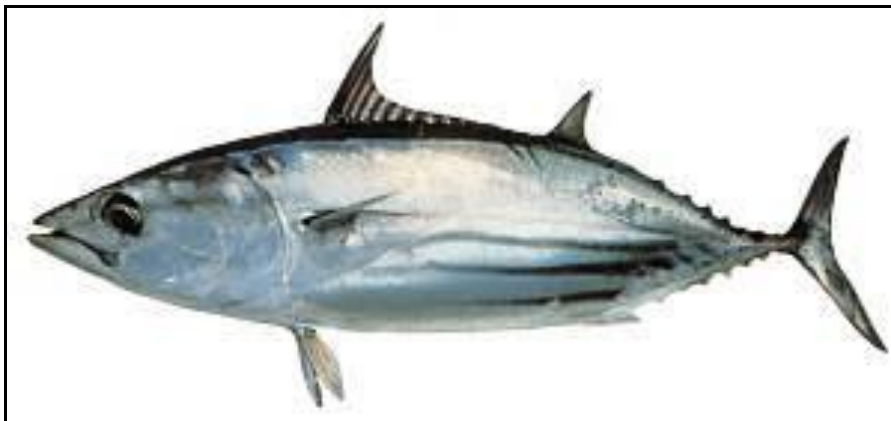
Figure 2. Katsuwonus pelamis (FishBase).

Research results of Rochman et al (2015), Zedta et al (2017) and Nurdin & Panggabean (2017) show that the capture length of K. pelamis in the South Indian Ocean, Java was 38.73, 39.4, and 40 cm, respectively, while the results of Hidayat et al (2017) in the Pacific Ocean showed a capture length of 40.1 cm. The difference in the length value of first catch in each region is strongly influenced by the fishing gear used. The average length in this study was 42.5 cm. The results of Nikijuluw (2009) and Jatmiko et al (2015) showed that the Lm of K. pelamis at maturity was between 41-43 cm in the Indian Ocean. Indian Ocean Tuna Commission (2014) reported that the Lm of K. pelamis is 44 cm. The Lm in the Western Indian Ocean is 37.8 cm (Grande et al 2010) and 44.7 cm in the Southern Indian Ocean, Bali (Hartaty & Arnenda 2019). These differences can occur because of the suitability of environmental conditions (Udupa 1986; Lambert et al 2003). In this study, K. pelamis caught in the Southern Indian Ocean, Java and Nusa Tenggara, had not yet reached gonad maturity. A large number of young fish caught will put the fish stock at risk.