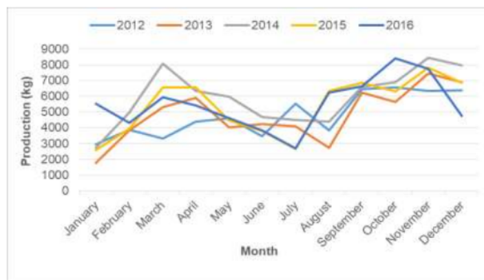
Figure 2. Production from 2012 to 2016

From the table and figure, the highest production occurred in 2014 with a production of 71,626 tons. Whereas the lowest production occurred in 2012 with a total production of 57,762 tons. Whereas for the month with the lowest production occurred in January 2013 with production of 1,764 tons and for the month with the highest production occurring in November 2014 with a production value of 8,456 tons. It can be seen that the month which has the lowest production is between December and January. This is caused by bad weather characterized by high intensity rain, strong winds so that the waves are large which causes fishermen to be reluctant to sea.