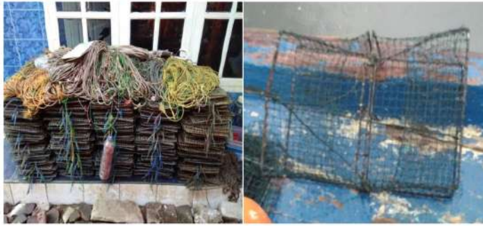
Figure 2. Pots used for Portunus pelagicus catching (original).

Catch of pots. There are various sizes of P. pelagicus that are caught, starting from small, medium to large, and, indeed, bycatch such as, conch, octopus, etc. The number of catches every day is uncertain depending on the season and the condition of the waters.