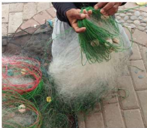
Figure 1. Bottom set gillnet (original).

Bottom set gillnets. The net used to catch P. pelagicus (bottom set gillnet) is basically the same as basic gillnet, which consists of top rope, float rope, float, net body, bottom rope, ballast rope, ballast, rope and float sign. The net material is made of PA mono filament with mesh size 4-4.5 inch. One unit of bottom gillnet set usually consists of 16 pieces of gillnets. The body of the net is often damaged due to coral, or other hard objects from the sea floor, or a result of the process of removing P. pelagicus crabs from nets body that is very difficult and often results in torned nets, Fishermen sometimes even deliberately cut the net to ease the work. This results in the replacement of the body of the net with the new one and must be done at least once a month. Bottom set gillnet photo could be seen in Figure 1.