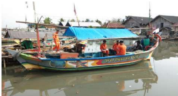
Figure 3. Fishing boat (original).

Fishing boat. Boats used for both fishing gears are relatively the same. The boat is made of wood with an average size of 8.5 m length, 2.78 m width and 0.7 m deepness. The engine used is a diesel engine with 24 HP power. One of boats used could be seen in figure 3.