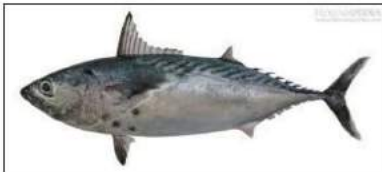
Figure 3. Auxis thazard (FishBase).

According to Ghosh et al (2012), the size of the fish first reached gonad maturity at a fork length of 29.7 cm. According to Tampubolon et al (2016), A. thazard in the waters of western Sumatera have a standard length of 34.89 cm. Based on the research of Ghosh et al (2012), the frequency of mature tuna landed at the Kusamba fish auction is only 12% of the total sample. This can be caused by the size of the mesh used by the fishermen, which is too small, causing immature fish to be unable to escape from the net.