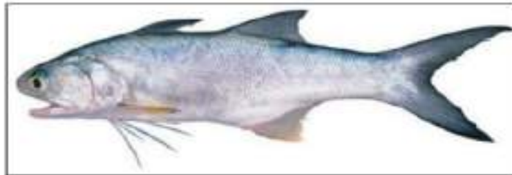
Figure 1. Eleutheronema tetradactylum (source: FishBase).

E. tetradactylum belongs to the Eleutheronemidae family, which consists of 41 species in 8 genera, which are epibenic fish and can be found in all tropical and subtropical marine waters. E. tetradactylum is a protandrous hermaphrodite fish (Motomura 2004). The number of fishing activities causes this fish stock to rapidly decline, marked by a drastic decrease in catch (Wijopriyono et al 2012). Wijopriyono et al (2012) state that In 2012, the production of E. tetradactylum was only 9273 kg with a very significant decrease in production, namely 49822 kg when compared to the production in 2008. The optimum sustainable production value (Catch Maximum Sustainable Yield) of E. tetradactylum was 4067 kg per year within an optimum fishing effort of 497 trips per year. Fishing effort in 2012 was 849 trips (170.8% of the optimum fishing effort), so there has been an overfishing of E. tetradactylum (Indra et al 2013).